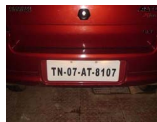
Figure 6. Original Image

Implementation of the techniques was done on different images. Colored images were converted into gray scale image and then segmentation and recognition methods were applied. A sample grey scale image (figure 6 & 7) is considered for segmentation and object recognition using Sobel, Prewitt, Roberts, Canny, LoG .The segmented image and recognized image using different edge operator’s techniques are shown in figure 6 & 7.