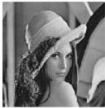
Figure 7: Original Image