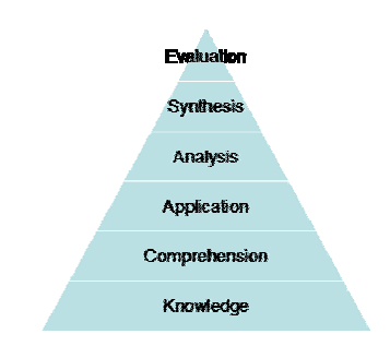
Figure 2.1: Hierarchy of the sub-domains of Cognitive Domain

The cognitive domain encompasses a hierarchical series of intellectual skills involving the acquisition and use of knowledge that ranges from simple recall to the ability to judge and evaluate learned material. Bloom identified six levels within the cognitive domain.