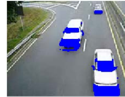
Figure 3: Moving object detected