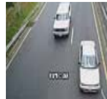
Figure 2: Traffic video

This reduces the computational time and mismatching of the pixel was also avoided. Thus noises can be reduced. And also rather than change detection mask, background difference mask is considered. This also improves the quality of the video object detection.