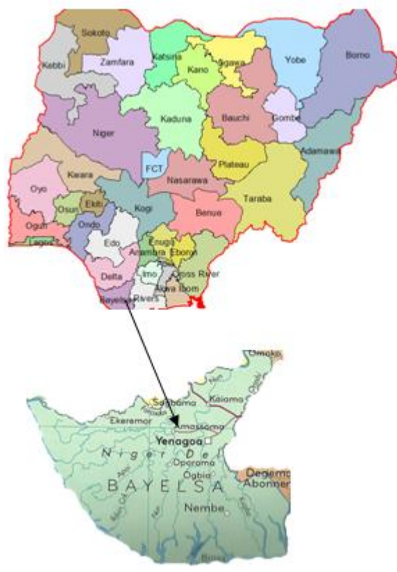
Figure 1: Map of Bayelsa State