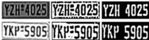
Figure 1: License plate sizing sequence

Components of algorithms that adjust for the angular skew of the license plate image to accurately sample, correct, and proportionally recalculate to an optimal size.