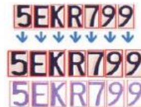
Fig.4 Optical character recognition process

This is the process that identifies individual alpha numeric characters on a license plate. Algorithms also look for characters of equal color and equidistance, with similar font structures to break apart each individual character. This sequential congruency of the characters embodies a characteristic set that is typically uniform, regardless of the type of license plate. Character Segmentation separates each letter or number where it is subsequently processed by optical character recognition (OCR) algorithms. It translates the captured image into an alpha numeric text entry.