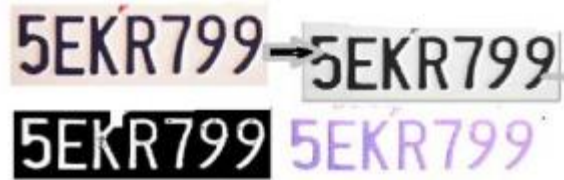
Figure 3: Character normalization

The algorithm in regulating the contrast and brightness of the captured license plate image is shown below in Fig. 3.