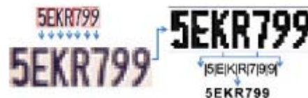
Fig. 5. Syntactical analysis

Algorithm to verify alpha numeric information and arrangement with a specific rule set. The algorithms operate sequentially with instructions being executed in milliseconds. The successful completion of each algorithm is required before subsequent algorithms can be operational.