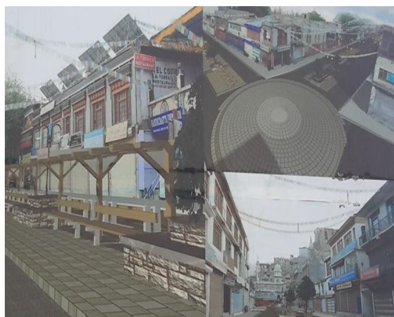
Figure 4: Leh beautification poster

With evolving tourism industry of Ladakh, the administration is working on ground level for improving general topography of region especially in and around Leh town. This can be seen very well in form of new pavement work being undertaken in main market area in fig .4 and various sign boards of hotels and guest houses which Municipal Commission, Leh has put at junction points in fig. 5. The threat of groundwater pollution from soak pits in the wake of absence of a sewerage network and treatment facility is there in Leh town and in some areas like Chubi can already be seen due to shallow aquifers (Dolma et al,2015).