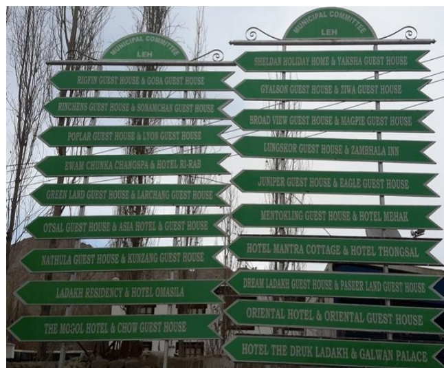
Figure 5: Hotels direction signs installed by Leh Municipal Committee