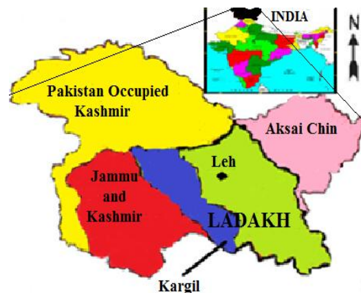
Figure 1: Location map of the study area

Leh is the district headquarter and only township in the district and the relief ranges from 3250m (amsl) lowest to highest 4500m (amsl) with a population of 1,47,104 (Census.,2011). Ladakh is a cold desert which was partially opened to tourism in year 1974 and tourism is expanding very rapidly ever since. Ladakh has a unique strategic location and touches international borders of Pakistan, China and Afghanistan (Fig.1).