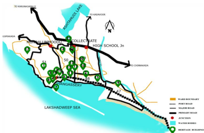
Figure 6: Geographical location of study area