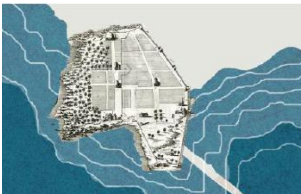
Figure 4. 11th -14th Century Medieval Period

Being an important site, Kollam was frequently mapped by Europeans from the sixteenth to nineteenth centuries.