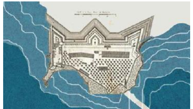
Figure 5: 15 th Century arrival of Portuguese

Thangassery, the port of Kollam had been an important trading center for many centuries. Its significance as a landing point for traders is evident from its colonial history when there were repeated attempts to take over possession of this location.