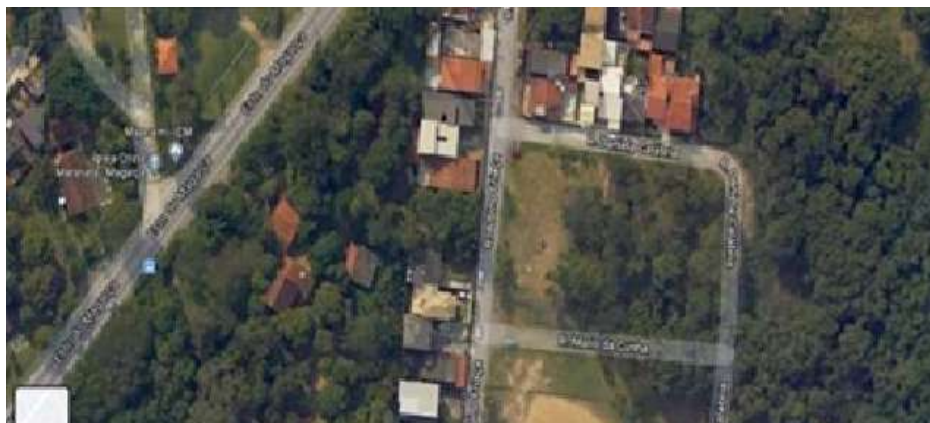
Figure 1: Area before the construction of the Colinas do Magarça Condominium

Figure 1 illustrates what the urban area was like before the construction of the Colinas do Magarça Condominium