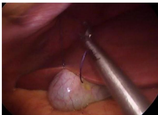
Figure 1: Suture taken through the fundus of GB Fig.4: suture taken through hartmann's pouch

Patient was placed supine on the table with the legs split apart. Both arms were placed at an angle less than 90° to the torso. Umbilicus was everted and an infra umbilical curved (smiling) incision 2.0 to 2.5 cm in length was given (Fig.1). This was deepened through fat and flaps were undermined to expose fascia. A Veress needle was inserted through this incision and 12 mm Hg pneumoperitoneum with CO 2 was induced and maintained. We used two ports one 5 mm port for camera and another 10 mm working port through which laparoscopic needle holder, Maryland forceps and extractor were introduced at the various steps of SILC