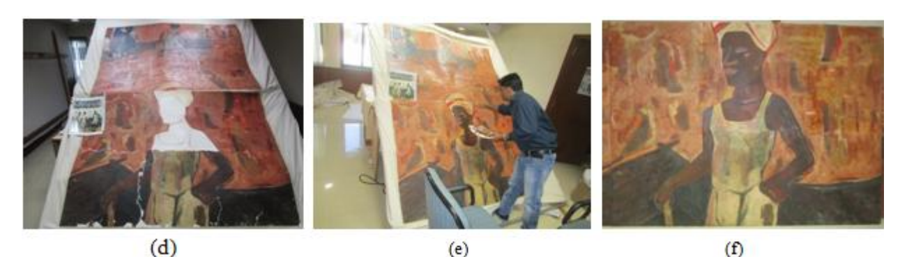
Figure 3: Photographs of panel number-4 showing (a) Before, (b) before lateral view (c, d, e) during and (f) After Conservation