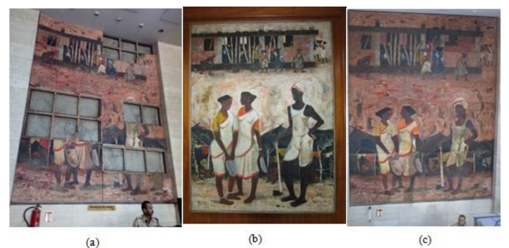
Figure 1: Photographs showing (a) Before, (b) Reference old photo and (c) After Conservation

is difficult to sum up India's heritage in few words. India has been the birth place of many great artists. KK Habber is one of the well known artists of India. In this paper, we are going to discuss about the conservation of oil painting made by artist Shri KK Habber in the year 1963.