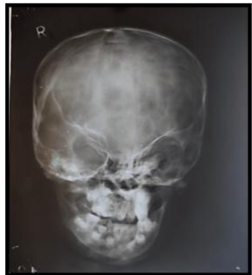
Figure 4: Lateral Skull Radiograph & Pa View Revealed Shallow Orbits, Depressed Nasal Bridge, Copper Beaten Appearance, Calvarial Thickening