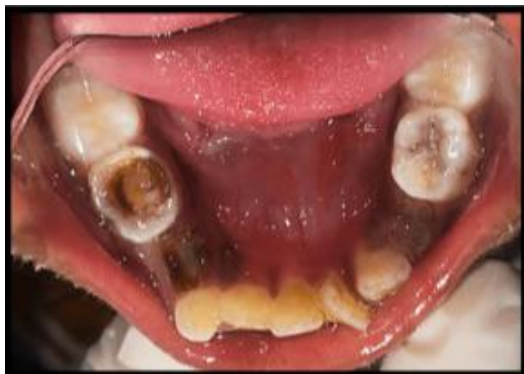
Figure 2: Intra Oral Photographs Showing Dentinal Caries IRT 75, Root Stumps IRT 74,84 and Grossly Decayed IRT 85