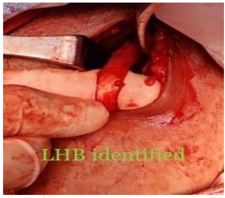
Figure 3: Long Head of Biceps identified

Patient underwent subjectoral biceps tenodesis. In the beach chair position a 4 cm incion was made centered over the inferior border of pectoralis major. After blunt dissection under the inferior edge of pectoralis major the long head of biceps tendon was palpated as a fusiform structure. The muscle was retracted proximally and laterally using retractor. Using Hohmann Chandler retractor coracobrachialis and short head of biceps were retracted. LHB tendon was delivered into the wound. The ends of the tendon were freshened and tendon edge was secured using locking Krackow stitch after removing the excess lenth of the tendon to ensure proper tensioning of the tendon while allowing full elbow Range of motion. Using a guidewire and a 8-mm reamer a 15mm bone deep tunnel was made at the junction of the middle and distal thirds of the intertubercular groove between the lesser and greater tuberosities. The tendon was fixed to the bone using a suture anchor till the screw head was flush with the bone. The wound was closed in layers after ensuring hemostasis.