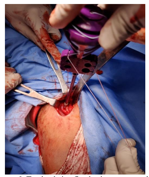
Figure 6: Tendon being fixed using suture anchor