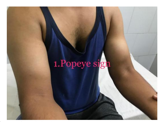
Figure 1: Clinical Photograph showing Popeye sign on examination

At the time of initial examination substantial ecchymosis was present over proximal aspect of left arm. Both passive and active range of motion of elbow and shoulder were full and were symmetrical to contralateral side. There was substantial tenderness over the bicipital groove as assessed by deep palpation. Manual motor testing revealed pain on resisted elbow flexion and supination as well as shoulder flexion. There was a weakness of left elbow flexion and supination against resistance as compared to the contralateral side. The distal neurovascular examination was normal for nerve function and vascular status of the arm.