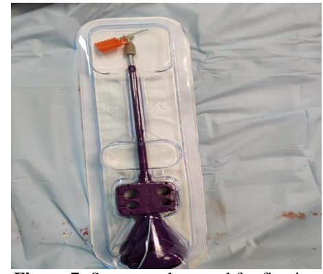
Figure 7: Suture anchor used for fixation