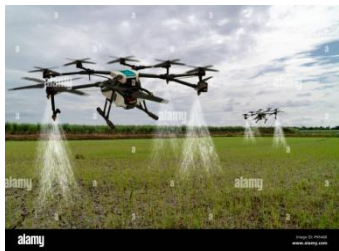
Figure 4: Fertilization through Drones

Fertilization: Soil naturally contains many nutrients, namely nitrogen, phosphorus, calcium and potassium. Plants cannot function properly and produce high quality food when their nutritional value is low. The natural level of nutrients in the soil needs to be increased by adding nutrients once the plants are harvested. Fertilizers have been used since the beginning of agriculture, but it is now well-known that their excessive use can harm the environment, if not properly managed. Therefore, farmers use IoT sensors to read and test soil samples for basic testing so that they can add fertilizer using appropriate and appropriate measurements. Fertilization is an important means of maintaining sustainable agricultural production systems.