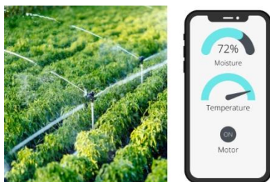
Figure 3: Irrigation with IOT

Irrigation / Water: The demand for water in agriculture is now increasing worldwide and especially in the Mediterranean countries, increasing the pressure to keep the water sources available. Therefore, smart, sustainable agricultural practices should focus on new and effective strategies