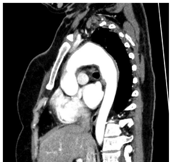
Oblique rendered image shows the concentric thickened low-attenuated wall of ascending aorta, arch of aorta and descending aorta on post-contrast image.