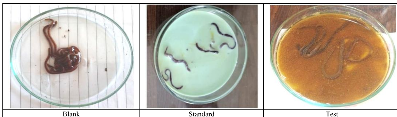
Figure 2: Anthelmintic Activity Of Blank, Standard (Albendazole), Test.

Extracts were tested for their anthelmintic properties. The extract caused paralysis that leads to the loss of mobility and loss their reaction to external stimuli, which leads to the death. The ethanolic preparation of Carica Papaya Linn. showed good anthelmintic activity at high concentrations, which was compared to the reference standard drug, Albendazole.