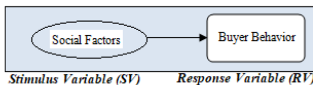
Figure 1: Conceptual Framework for Social Cultural factors and Buyer Behavior

In this study, social factors were perceived to be the stimulus for the weighted scores for buyer behavior. Buyer behavior was measured using primary data and a weighted score for the same was transformed to be continuous.