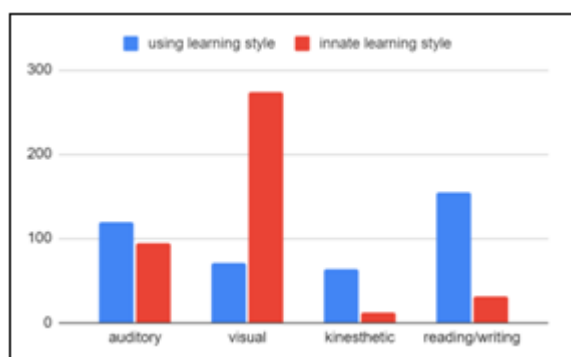
Figure 3.1: Chart comparing the number of student with their current learning style and their innate learning style categorized by VARK Learning Model

The results suggest that reading/writing is the most popular learning style employed by the students, followed by auditory style. However, the actual innate learning styles indicated different statistics. From their personal true learning style, the students are mostly visual learners. And kinesthetic learners are considerably the lowest innate