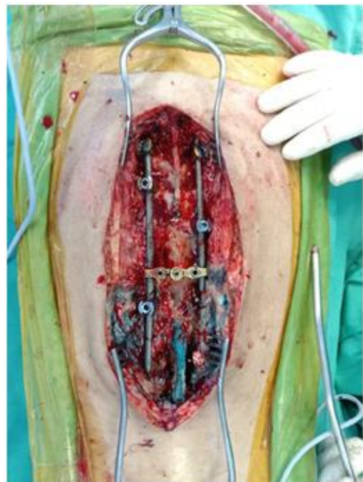
Figure 3: Surgical wound was debrided zone by zone with radical debridement.