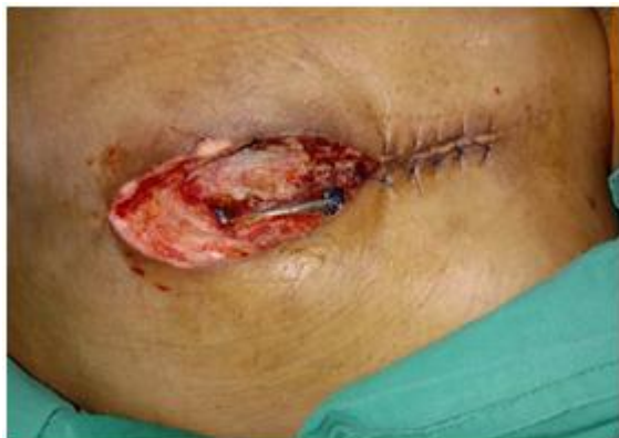
Figure 5: Partial closure with water tight suturing of upper half of the wound.

The late onset of surgical site infection involved 1 growing rod scoliosis implant with 2 lumbar and 3 thoracic instrumentations. The primary pathologies varied among the cases, including 1 case of tuberculous infection, 1 case related to traumatic surgery, 2 cases associated with scoliosis surgery, and 3 cases resulting from spinal metastases surgery. All patients had established risk factors for postoperative infection, except for 1 case of adolescent idiopathic scoliosis, which did not exhibit a clear risk factor. The other scoliosis case was at risk due to neuromuscular scoliosis. Clinical characteristics of the patients are summarized in Table 1.