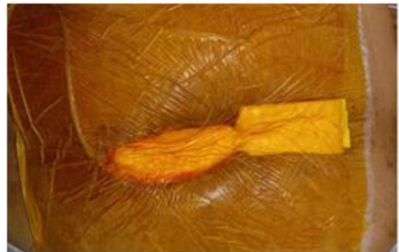
Figure 6: VAC dressing was applied as wound management to facilitate wound healing and eradication of infection.

negative for culture. Surprisingly, a histopathology examination revealed that one case had tuberculous infection, characterized by positive granulomatous inflammation.