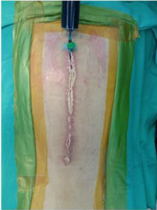
Figure 1: Surgical wound was injected with dilute 0.1% of methylene blue prior to wound exploration.

tuberculosis cultures, as well as tissue for histopathological examination. After exposing the wound, radical debridement was performed zone by zone to remove all the blue-stained soft tissue, including tissue beneath the spinal implant (Figure 3)