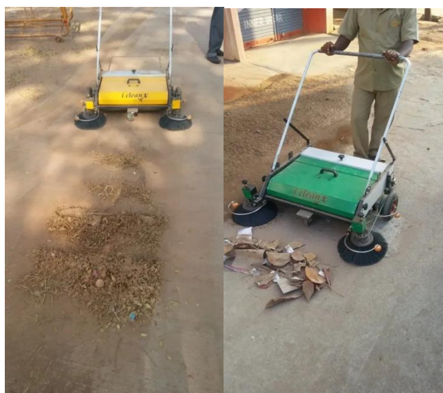
Figure 9: iclean X- A manually operated machine being used to sweep roads

A good example of a semi-manual machine that can be considered is a grass cutting machine. There are also many existing semi-manual sweeping machines that should be employed instead of using sweeping brooms which became orthodox and disadvantageous in more ways than one. One such example is the i-cleanX machine being produced by Triangle Innovations. The machine is used in several wards of the Bangalore Municipality and uses green technology instead of fossil fuels. The machine is designed in such a way that manual intervention is necessary only to push the cart.