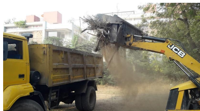
Figure 7: JCB bobcat emptying into collecting van

landfill or a dust collecting van. The vehicle runs on diesel and has a capacity of 460 liters/0.46 Cubic Meters.