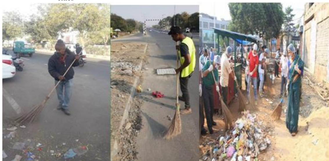
Figure 2: i. ii- Manual sweepers sweeping roads iii- Swachh Bharat Mission

Solid Waste management (SWM) involves collection, transportation, deposit and treatment of wastes making street cleaning an integral part of SWM. These wastes are cleaned and collected using various street cleaning techniques. Even with intensive cleaning techniques and frequencies, the roads are still not clean and we can still visibly see littering and garbage everywhere. To deal with this issue, the central government of India came up with the Swachh Bharat Mission in 2014 to achieve universal cleanliness and sanitation covering all divisions of Indian roads from villages, towns and municipalities. A part of it is making people aware of the importance of cleanliness, hygiene and health, and providing necessary sanitation facilities including solid waste disposal systems. With fewer and fewer people interested in doing lowly paid jobs such as street sweeper, the civic authorities have to depend on machines for cleaning the streets to meet the sanitary needs of the population as cleanliness also contributes to greater general public health.