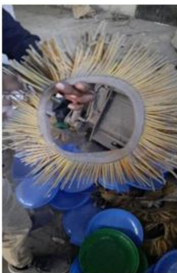
Figure 6: Brush of JCB sweeper

The bobcat sweeper is operated by a single person and is usually operated at a speed of 15 kms in order to collect the dust present on the road. In order for it to facilitate this function it has 1.525 meters of sweeping area and an overall width of 1.89 meters. Its brush is a combination of steel and polypropylene.