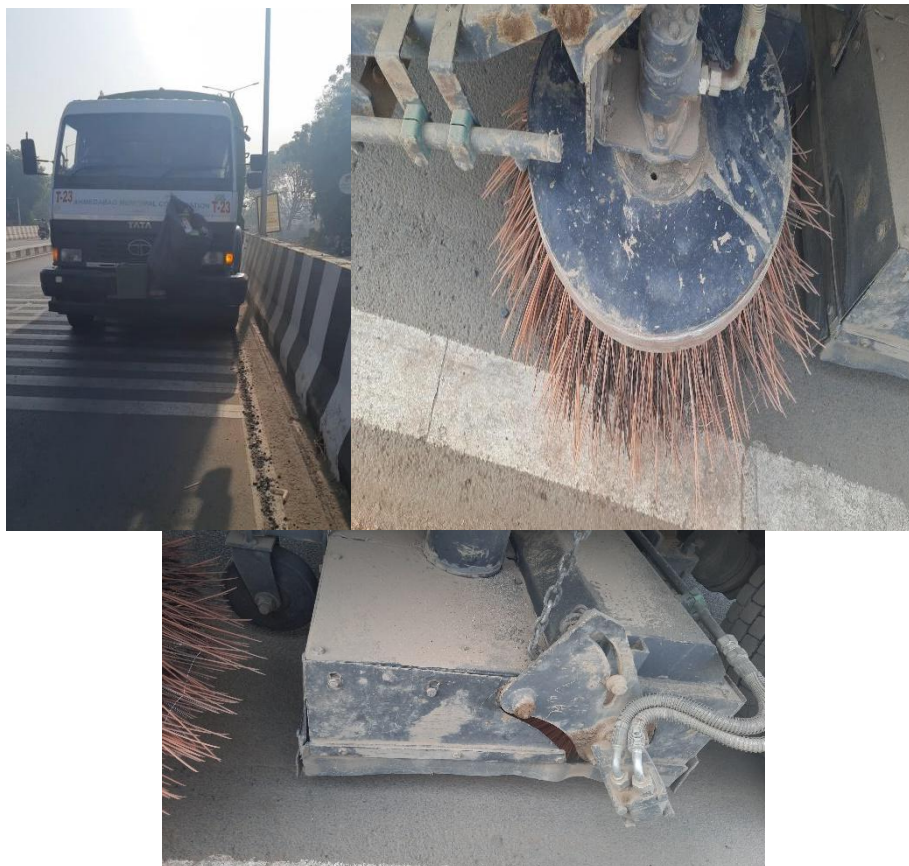
Figure: 8 TPS Sweeper

The TPS sweeper is operated by two people, a driver and an assistant. It is operated at a speed of 5-10 km/s in order for it to operate at maximum efficiency. This machine comes with a meter of sweeping area and an overall width of 1.89 meter. TPS also comes with a brush that is a combination of steel and polypropylene.