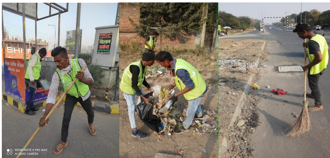
Figure 3: Manual sweeping being done on various roads in the ward

AMC sources most of its street cleaning requirements through manual sweepers only. It employs a total of 1500 manual sweepers throughout the 48 wards present in the municipal corporation. The Chandlodia ward where the research was conducted employs 224 manual sweeping labor.