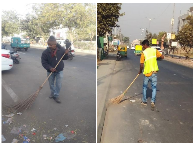
Figure 4: Brooms used for manual sweeping

The sweepers in AMC use only one main type of broom for sweeping the roads which looks like this: