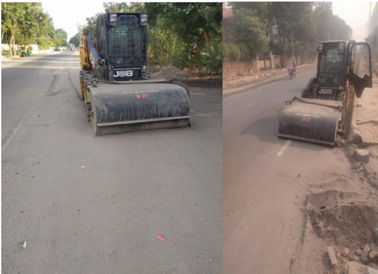
(i) (ii) Figure 5: JCB Bobcat Sweeper (i,ii)

JCB-Bobcat Sweeper: This machine is majorly being used with the help of a long cylindrical brush and a dust collector to clean narrow roads in the municipality. It collects dust that is placed beside the cylindrical brush.