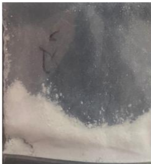
Plate 2: Zinc oxide nanoparticles

Ernakulam's. Other materials required for the experiment are water and vegetable oil purchased from local market, Malappuram. (Plate:2)