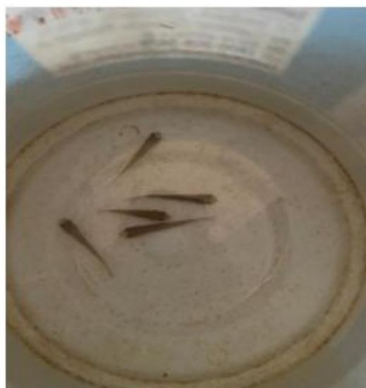
Plate1: Catlacatla fingerlings

Catla ( Catlacatla ) fingerlings average weight 4.00g and average length 4cm (picture.1) were purchased from a local fish farm-Aqua fish Aquarium, Kottakkal, Kerala. Fingerlings were reared and acclimated for 45 days in a plastic container with 5 liters of freshwater. Fish were given commercially available fish pellets, while pH, temperature, and dissolved oxygen levels in the water were continuously measured at regular intervals. Also, water in the tub were changed regularly. The Catla fish has a major use for their muscle mass in the market. (Plate 1)