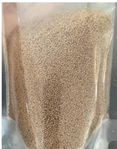
Plate 3: Basal fish feed

Different weights (0.3g, 0.6g, 0.9g, 1.2g, 1.5g) of zinc oxide nanoparticle (nZnO) were carefully measured out and combined with vegetable oil in plastic bowls (picture.2&3). Grinded fish pellet was added into each of those bowls and mixed thoroughly to form the maximum absorbance of the nanoparticles into the fish pellets. Grinded fish pellet alone also treated with vegetable oil to form the control diet. These were kept in open bowls at normal room temperature for two days, so that the oil could be absorbed into the feed. The diet was then placed in a dry, cool place for usage. (Plate:3, Plate:4).