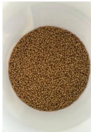
Plate 4: Basal feed mixed with zinc oxide nanoparticle