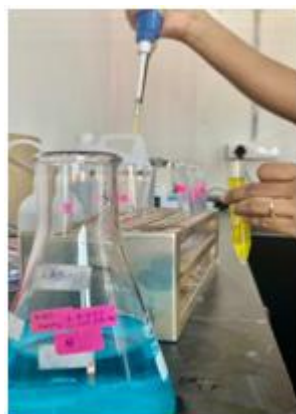
Plate 6: Protein estimation

At the end of experimental period, the protein content of the fish consumed with each concentration of nZnO was assessed and compared to the control test (Plate 6).