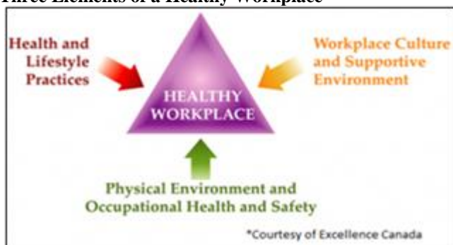
Figure 1: Three Elements of a Healthy Workplace