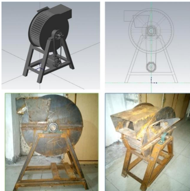
Figure 4: Different views of the Areca Extraction machine