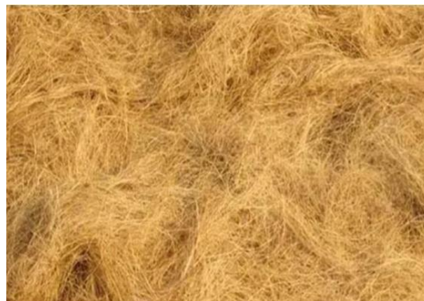
Figure 2: / Extracted Arecafibres

Areca fibres will be extracted from the Areca husk and generally lignocellulosic, helically wound cellulose microfibrils in an amorphous matrix of lignin content and hemicelluloses. The fibre properties of Areca are mainly depending upon the biochemistry and its structure. The proportions are alpha cellulose 53.20%, hemicelluloses 30 - 64.8%, lignin 7 - 24.8%, 4.4% - 4.8% of ash, 11.7% of moisture, and a very negligible percentage of pectin and wax. Approximately 2.50 to 2.75g of Areca fibre can be segregated from one Areca fruit husk.