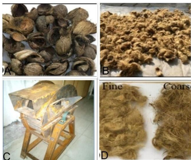
Figure 5: (A) Areca sheath (B) Softened Areca sheath (C) Areca Extraction machine (D) Extracted Areca fibres