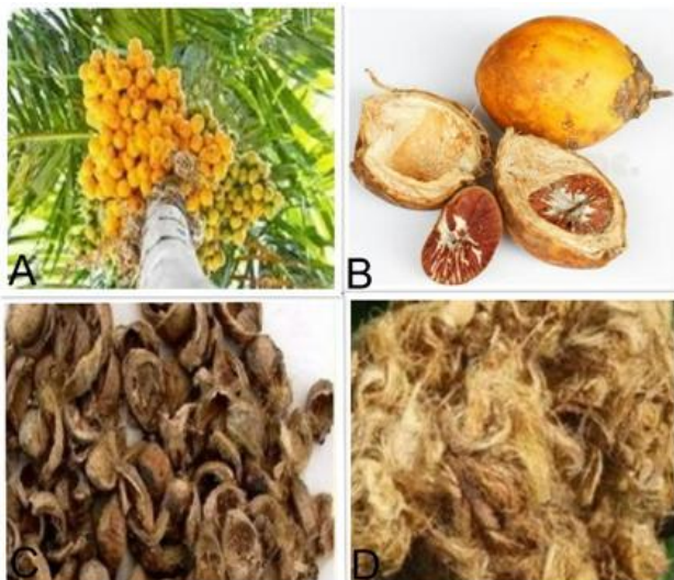
Figure 1: (A) Arecaplant (B) Arecafruit (C) Areca sheath (Dried) (D) Softened Areca sheath (before extraction)

The husk of Areca fruit constitutes about 60 - 80% of the total weight and volume of the Areca fruit and it is a hard - fibrous material. The Areca fibre is mainly cellulosic fibre and contains different proportions of hemicellulose (35 - 64.8%) and lignin (13.02 - 26.0%), pectin, and protopectin (1 - 3%) respectively. This highly cellulosic material is used as fuel in the Areca nut process. The average fibre length is