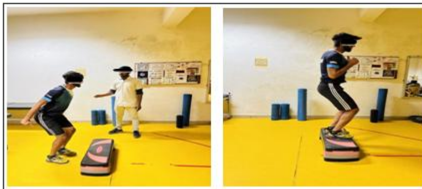
Figure 1: Squat block jump