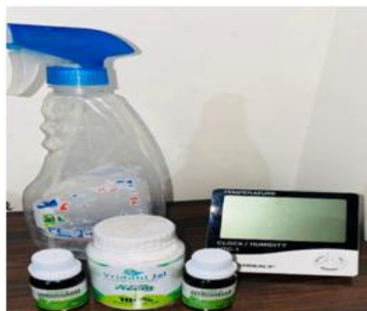
Figure 4: Materials required during experiment Fixed with muslin clothes

Culture and rearing of Aphids: After this much age of bean plants, A. craccivora were collected from already infested bean plants from a local farm. Infested part of the bean plant sheltering with A. craccivora colonies were brought and newly hatched aphids were transferred for rearing by a fine paint brush to the fresh bean twigs of a single bean plant which were maintained in seed infused plastic polythene bag and covered with plastic folders whose tops were covered with muslin cloth and fixed with cello tape to prevent insect escape till experimental requirements at ( 27\pm 2 °c & 34\pm 5 % R. H).