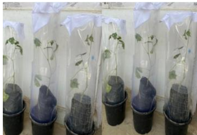
Figure 3: Aphids introduced in Bean plants covered with plastic folders