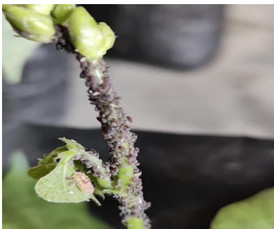
Figure 2: Colony of cowpea aphids infesting bean plant