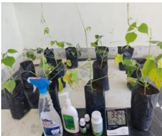
Figure 1: Bean plants grown in seed infused plastic bag