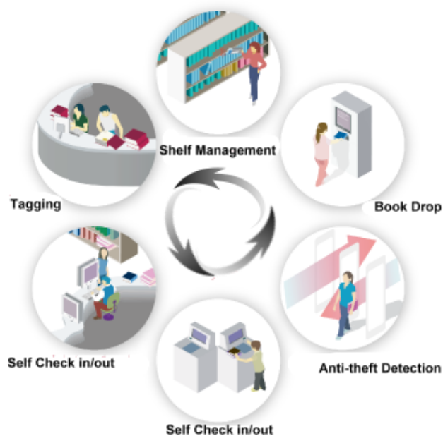
Library RFID Management System