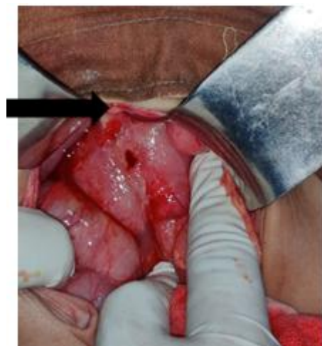
Figure 1: Pre - pyloric peptic Perforation

On examination, the patient appeared generally unwell, quiet, lying still on his stretcher. he was febrile to 101.9, and tachycardic to 136. Blood pressure and respiratory status on room air were normal. Chest and heart examinations were unremarkable. The patient's abdomen revealed soft, mild tenderness at epigastric region with no guarding and no rigidity.