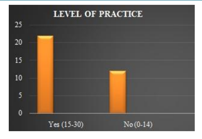
Objective 3: To find out the association between knowledge and practices regarding crash cart system.