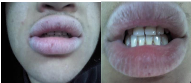
Figure 8: Final prostheses

Instructions about function, limitations of the prostheses, the need for frequent adjustments, and establishing good oral hygiene were given. The patient was scheduled for periodic recall visits and he is happy with them.