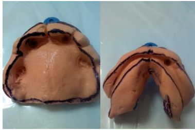
Figure 4: Primary impressions