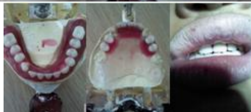
Figure 7: Try in stage