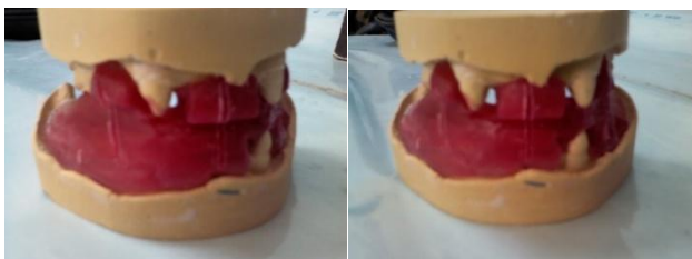
Figure 6: Bite registration