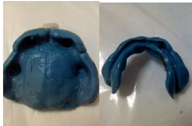
Figure 5: Secondary impressions