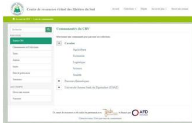
Figure 2: Assane Sèck University of Ziguinchor institutional repository

This platform is a space for information, sharing and awareness-raising on various territorial issues, particularly Governance, Natural Resources and Vulnerabilities, Human Mobility, Economic and Social Development, etc. This resource centre was created in partnership with Grdr and AFD funding.