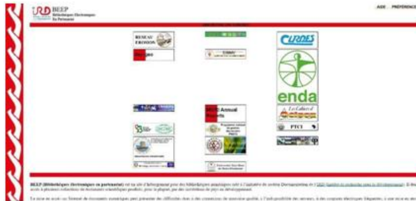
Figure 4: IRD's collective digital libraries

Bibliothèques électroniques en partenariat (BEEP) is a hosting site for digital libraries created on the initiative of the Documentation sector of the IRD (Institut de recherche pour le développement). It provides access to several collections of scientific documents produced, for the most part, by institutions in developing countries. It brings together 17 digital collections from universities and research institutions.