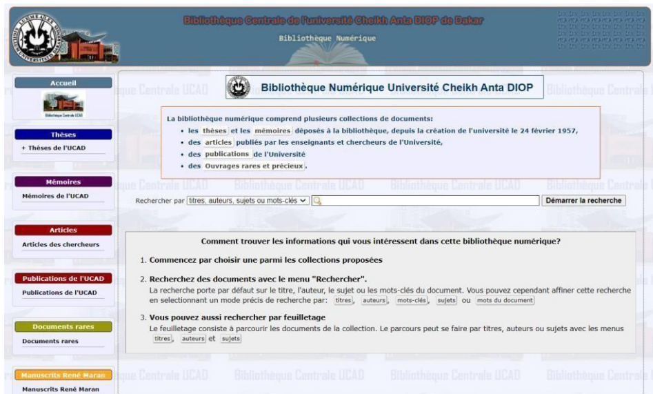
Figure 1: BUCAD digital library

The Assane Sèck University Virtual Resource Centre [Université Assane Sèck de Ziguinchor (UASZ) is a public higher education institution located in Ziguinchor in the Casamance region of south-west Senegal]. The Virtual Resource Centre is a digital platform [The platform can be accessed at: https://rivieresdusud.uaszn.sn/ ] for those involved in local coastal development. Its aim is to bring together, organise and promote the knowledge produced on the coastal regions (Senegal, Guinea Bissau and Guinea) and to collect and disseminate the publications of UASZ teacher-researchers and students.