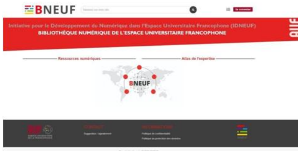
Figure 5: Home page of the BNEUF platform