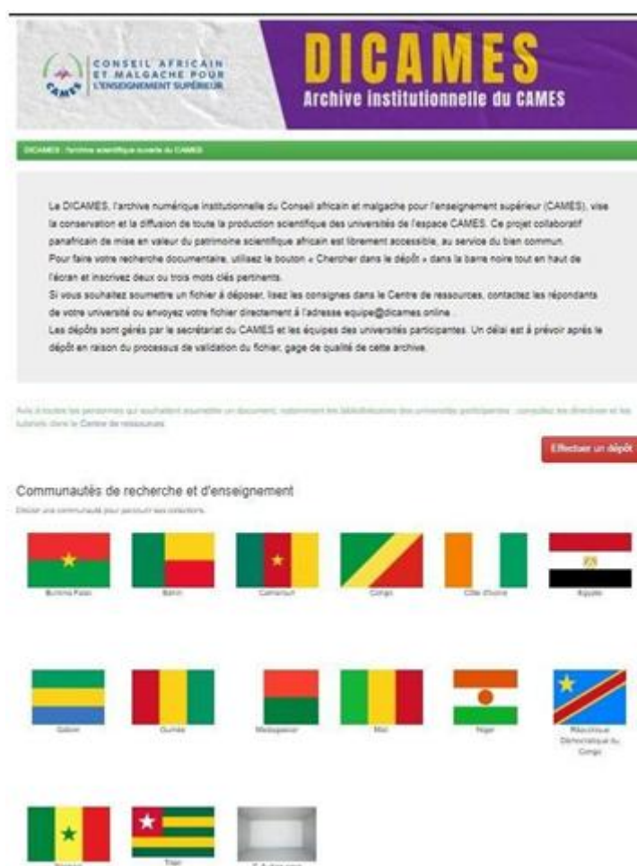
Figure 3: CAMES Institutional Repository Platform

DICAMES enhances the Silhouette program by making it easier to create lists of candidates' publications. Each CAMES member university is invited to join this collective project, which will be carried out in collaboration by signing an agreement.