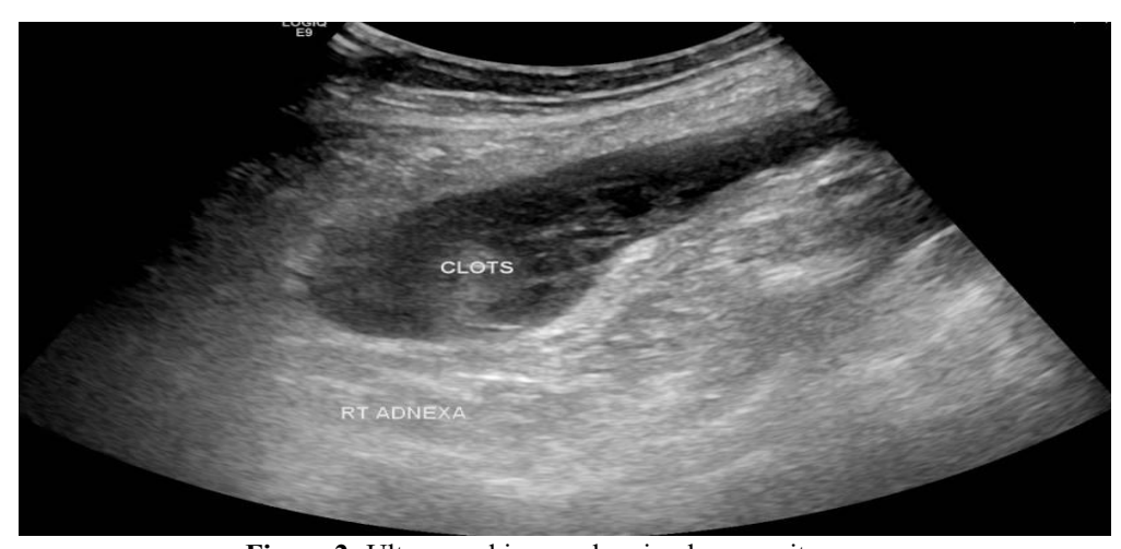
Figure 2: Ultrasound image showing hemoperitoneum

She underwent emergency diagnostic laparoscopy which confirmed the ultrasound findings. Hence, proceeded with laparotomy. Uterus was enlarged to 14 weeks size and bowel was densely adherent to fundus and right lateral side. There was mild hemoperitoneum and collection of clots along right adnexa. There was a 5 cm x 2cm rent on right fundoanterior aspect of the uterus. One sac was seen protruding through the