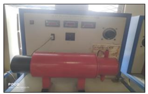
Figure 4: Experimental set up

The experimentation is conducted to analyze the thermal conductivity of the composites fabricated by reinforcing graphene hydroxyl with aluminium 6061. Graphene, having carbon purity >99.5%, was reinforced into the Aluminium, which was added at a temperature of 700 °C with stirring time of 3-4 min. The Amount of Graphene was varied from 0.0 Wt.% (as-cast) to 1.0 Wt% by weight. Fig.4 shows the schematic representation of experimental set up. It consists of Aluminium composite rod, one end of which is heated by electric heater and the other end projects inside the cooling water jacket. The mid portion of the rod is thermally insulated from the surroundings using glass fibre. The temperature of the rod is measured at five different locations, T1 to T5 along its length. When the temperature gradient exists in a composite rod, experiences have shown that there is a transfer of heat from high temperature region to low temperature region. Constant water flows is maintained and adjust the power input to the heater using the heat controller. Wait until the temperature T_1 become constant over time, indicating steady state. Use the channel selector and digital temperature indicator and read the temperature T_1 - T_5 on the metal rod and read the inlet and outlet water temperature of the cooling water, then measure the water flow rate. Based on the measured temperature gradient along the length of the composite rod and the thermal conductivity of composite rod are calculated.