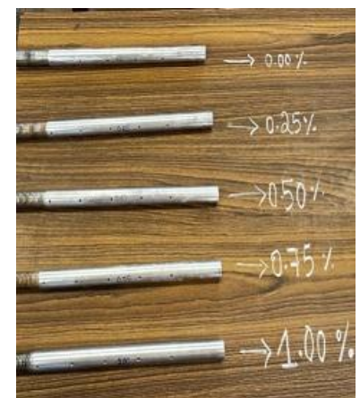
Figure 3: Specimen rods

The cast specimen was machined for testing purpose using CNC and Lathe to get the required ASTM standard dimension for conductivity test.