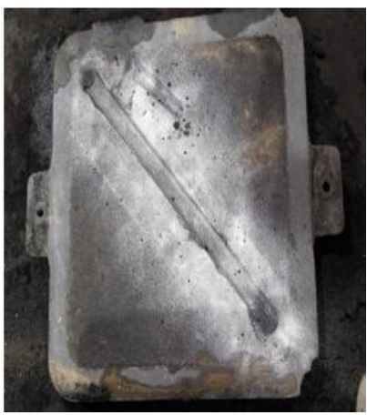
Figure 1: Mould preparation

The stirred mixture is then reheated to 700°C and maintained at this temperature for 10 minutes. Subsequently, the composite mixture is poured into a preheated sand mold and allowed to solidify naturally. Once solidified, the cast rod is machined to achieve a final size of 500 mm in length and 20 mm in diameter.