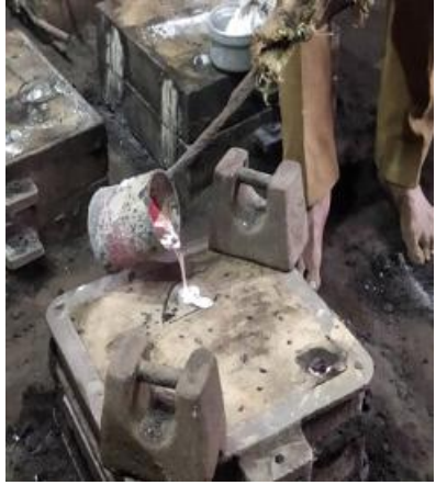
Figure 2: Pouring of molten metal