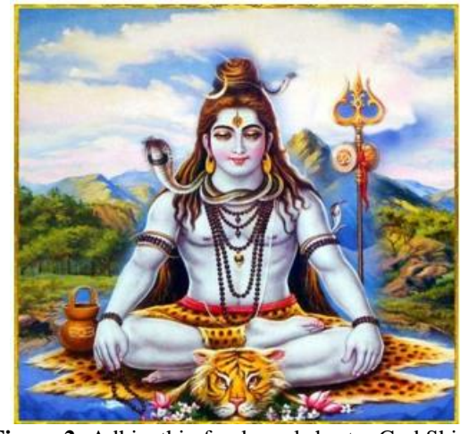
Figure 2: Adhipathi of ardra nakshastra God Shiva

In Indian astronomy 27 nakshatras mentioned. list of them first found in Jyotish Vedanga . Jyotish is one of the anga of Veda. Ayurveda is upaveda of Atharva Veda . Fundamental source of Ayurveda and jyotish shastra are the Vedas.