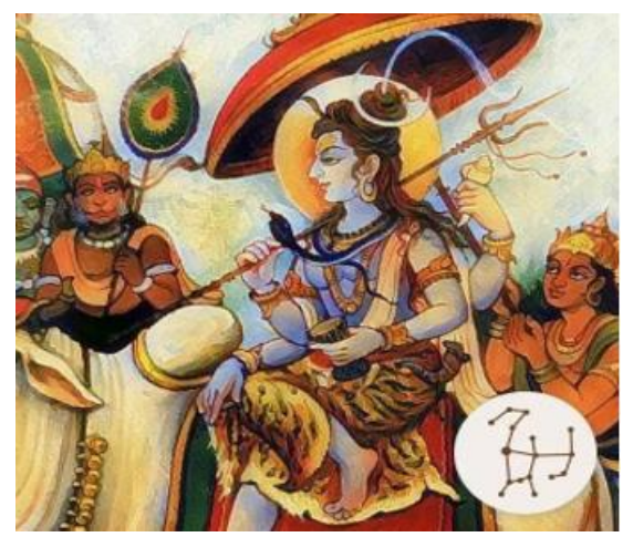
Figure 1: Sign of ardra nakshastra