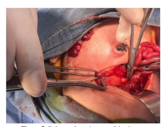
Figure 5: Release of atresic zone of duodenum

As a second surgical time, a transverse incision of approximately 5 centimeters is made at the level of the right hypochondrium, dissecting by planes until reaching the cavity, identifying the biliary tract with a widely distended stomach, preventing adequate visualization of the duodenum, Kocher maneuver is performed to release duodenum, a flange is observed at the level of the first duodenal portion, which causes stenosis site, blunt dissection is performed with mosco forceps and release of duodenum (Figure 5).5 cm at the level of the gastric pylorus, covering all its layers, an orotracheal feeding tube number 8 is introduced caudally with impossibility of passage to the duodenum, a transverse duodenotomy of approximately 1 cm in length distal to the site of stenosis is performed; performing gastroduodenum anastomosis by diamond technique with vycryl 5 - 0, corroborating functionality through the passage of the feeding tube and passage of the instilling of physiological solution.