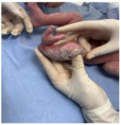
Figure 2: Image showing ectrodactyly of left foot and mesomelia of right pelvic limb.

After his initial care, he was taken to the neonatal intensive care unit to continue the diagnostic approach and to regulate the most appropriate therapeutic conduct. An abdominal ultrasound was performed, reporting a smaller left kidney with respect to the collateral one and an absence of vascularity in color Doppler mode, diagnosing renal hypoplasia; the echocardiogram identified interatrial communication vs. foramen ovale, large patent ductus arteriosus and moderate pulmonary arterial hypertension.