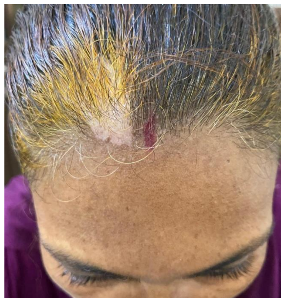
Figure 1: Before treatment (23 rd August 2023)

All of the above symptoms converted in to rubrics and repertorisation was done from the Homoeopathic software Radar 1.1.13.