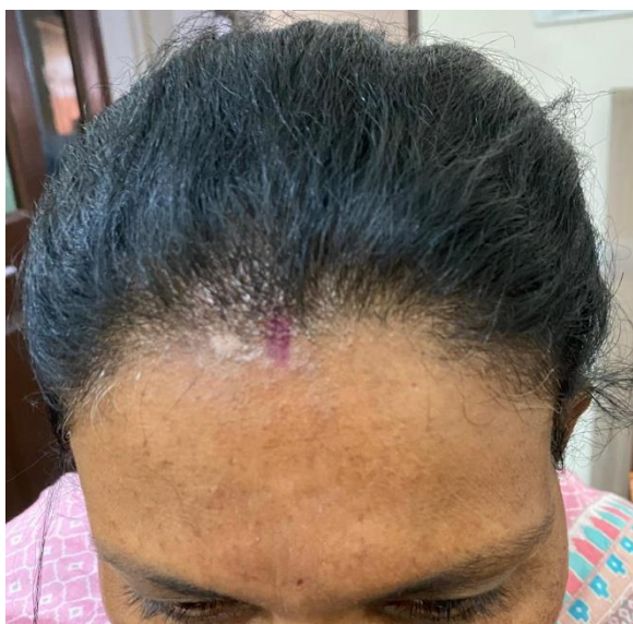
Figure 3: After treatment (15 March 2024)