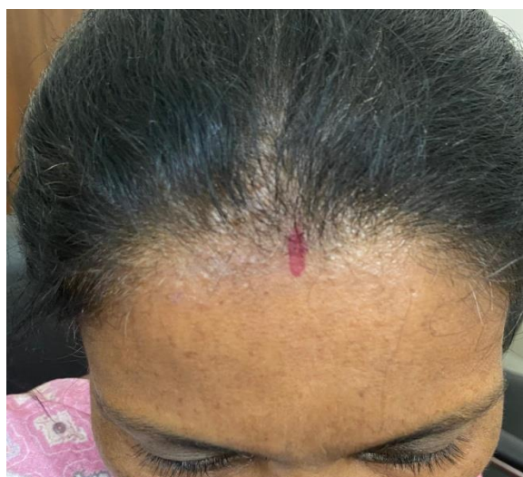
Figure 4: After treatment (25th May 2024)