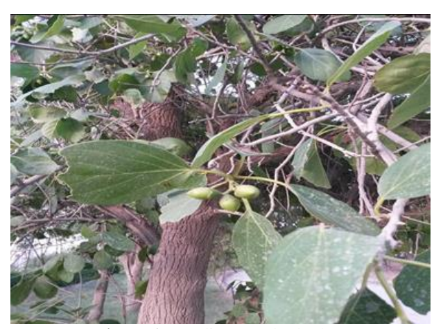
Figure 1: Cordia myxa bark plant