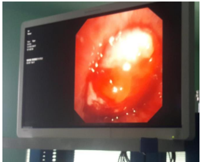
Figure 1: Tracheal Mass Yellow Coloured