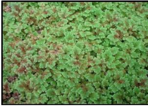
Figure 3: Azolla microphylla.