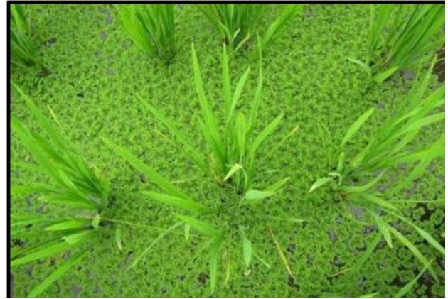
Figure 5: Azolla as biofertilizer in Cultivable Land

terrestrial animals, human food, medicine, water purifier, bio fertilizer, weeds and mosquitoes controlling agent, or removal of nitrogenous compounds from water. Azolla has been applied to the rich field as a classic fertiliser. It is a good source of protein and contains almost all essential amino acids and minerals. Various research has been done and is still ongoing to determine the capability of Azolla as a phytoremediation and to be used as a sustainable bioenergy source.