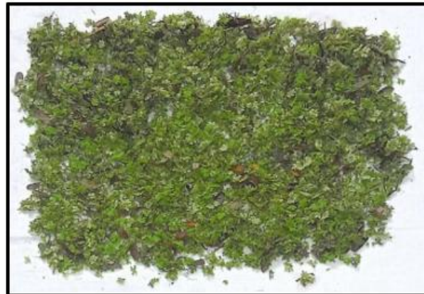
Figure 9: Shade Dried Azolla

samples were ground into a fine powder using a mixer grinder. The powdered samples were then stored in the air tight container and used for the analysis. The moisture content, ash content, protein, calcium, phosphorus, dietary fibre and total phenol were determined from the fern sample.