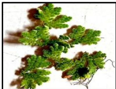
Figure 8: Azolla filiculoides

Azolla is also rich in proteins, essential amino acids, vitamins (vitamin A, vitamin B12, \beta Carotene), growth promoter mediators and minerals including calcium, phosphorous, magnesium, potassium, iron and copper. Among all the species, Azolla filiculoides is native to warm climates and tropical regions of the Americas as well as most of the old world, including both Asia and Australia. Azolla Filiculoides also grows in South America, western North America, Alaska, and Europe. Being a floating Aquatic fern, it can be found in usual stagnant waters, wetlands, and rice paddies in warm temperate and tropical regions, which is spread over lake surfaces to cover the water entirely. It takes only a few months to cover a lake.