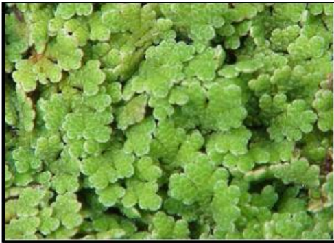
Figure 4: Azolla filiculoides

terrestrial animals, human food, medicine, water purifier, bio fertilizer, weeds and mosquitoes controlling agent, or removal of nitrogenous compounds from water. Azolla has been applied to the rich field as a classic fertiliser. It is a good source of protein and contains almost all essential amino acids and minerals. Various research has been done and is still ongoing to determine the capability of Azolla as a phytoremediation and to be used as a sustainable bioenergy source.