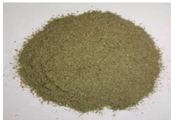
Figure 10: Powdered Azolla