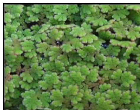
Figure 1: Azolla caroliniana

Azolla belongs to the Kingdom: Plantae, Division: Pteridophyta, Class: Pteridopsida, Order: Salviniiales, Family: Azollaceae, Genus: Azolla. The genus Azolla consists of two subgenera and six living species. Subgenus Euazolla include four species: Azolla filiculoides, Azolla caroliniana, Azolla microphylla, Azolla mexicana. The Subgenus Rizosperma include two species: Azolla pinnata and Azolla nilotica