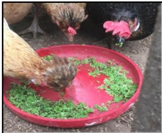
Figure 7: Azolla as Feed for Poultry

It was also found that broilers feed with Azolla resulted in growth and body weight values similar to those resulting from the use of maize-soya bean meal. Das et al., 1994 found that digested Azolla slurry remaining after biogas production was suitable as fish pond fertiliser.