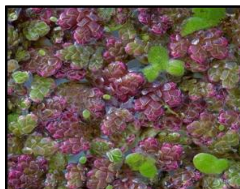
Figure 2: Azolla mexicana