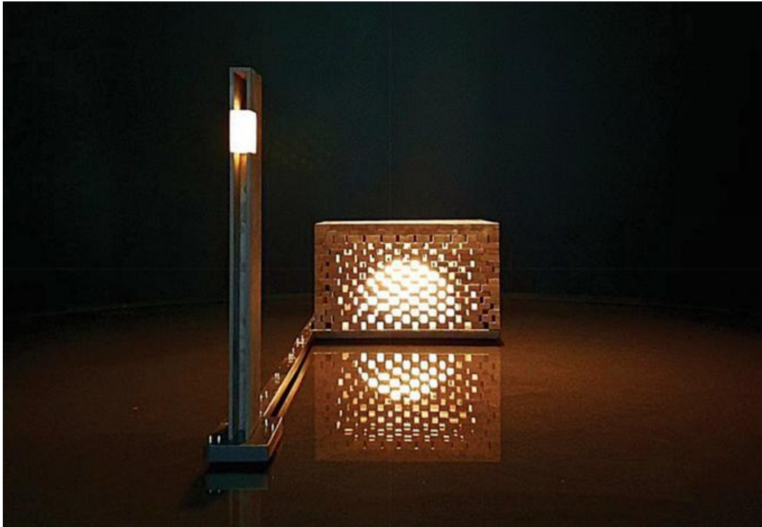
Figure 1: The project of the Kazan Cathedral Mosque from «Tsimailo Lyashenko & Partners».