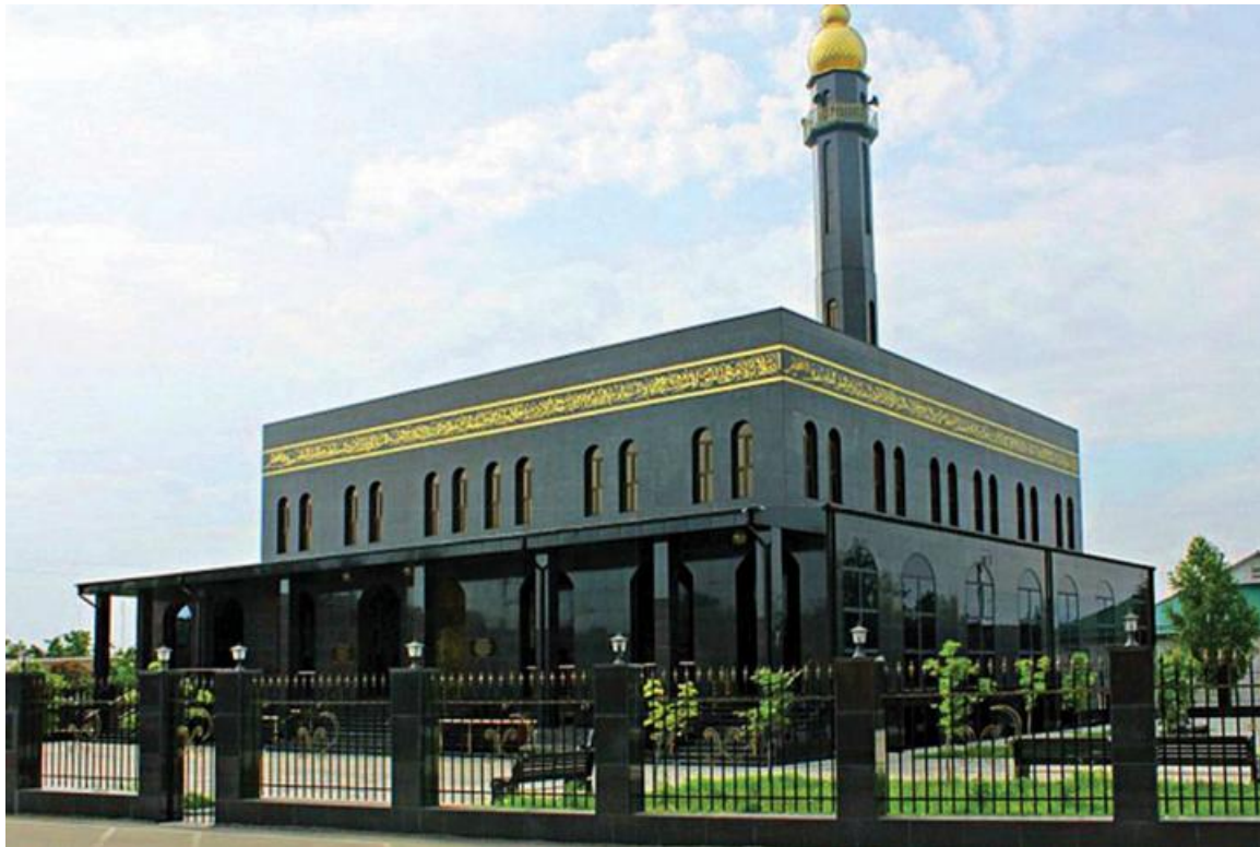
Figure 3: Mosque n. by Magomed Dadaev, Zakan-Yurt. 2011. https://northcaucasusland.wordpress.com/tag/zakan-yurt/