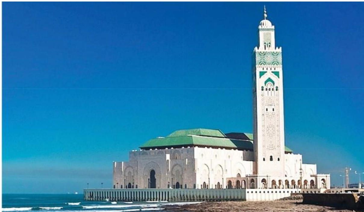
Figure 6: Hassan II Mosque, Casablanca, Morocco. 1986-1993.