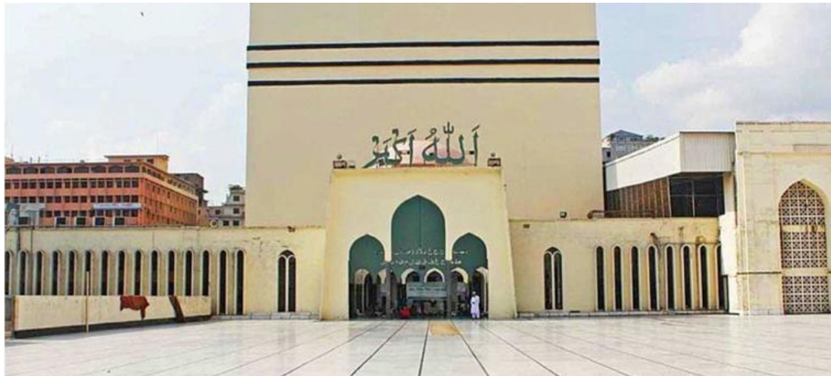
Figure 2: Baitul Mukarram Mosque, Dhaka, Bangladesh. 1959-1963.