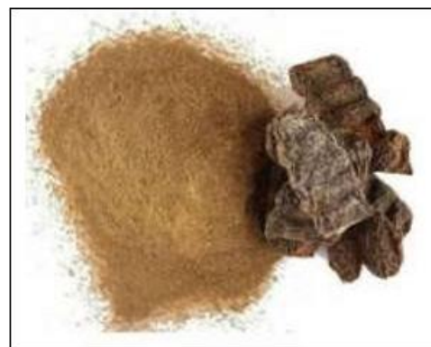
Figure 6: Shikakai