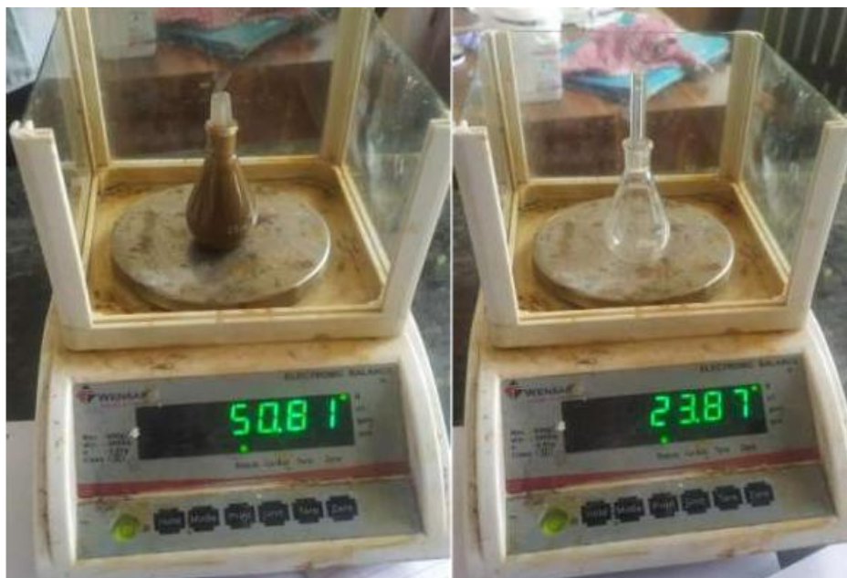
Figure 12: Density