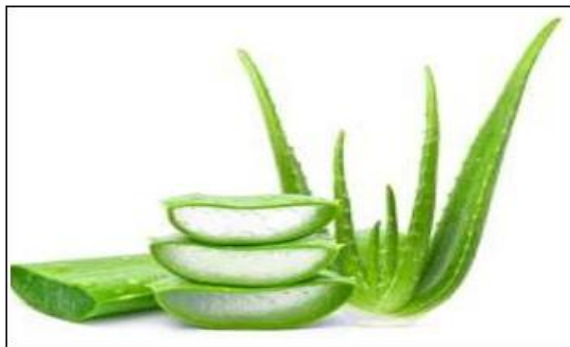
Figure 3: Aloe Vera