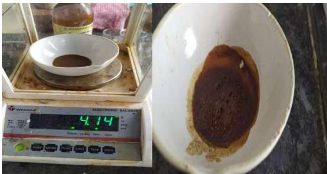
Figure 13: % Solid content