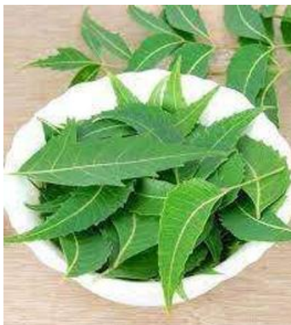
Figure 4: Neem