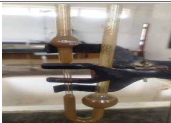
Figure 11: Viscosity