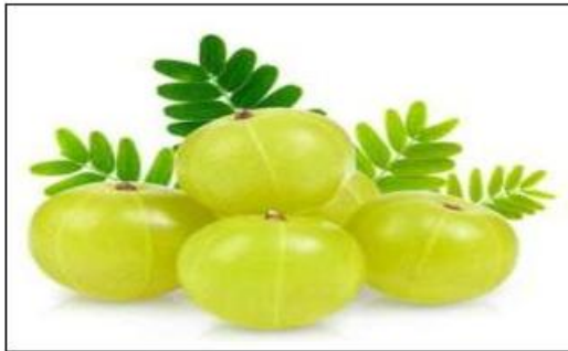
Figure 2 (Amla)