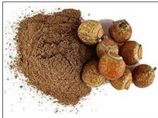
Figure 5: Reetha