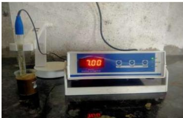
Figure 10: pH

readings are obtained with both buffer sol