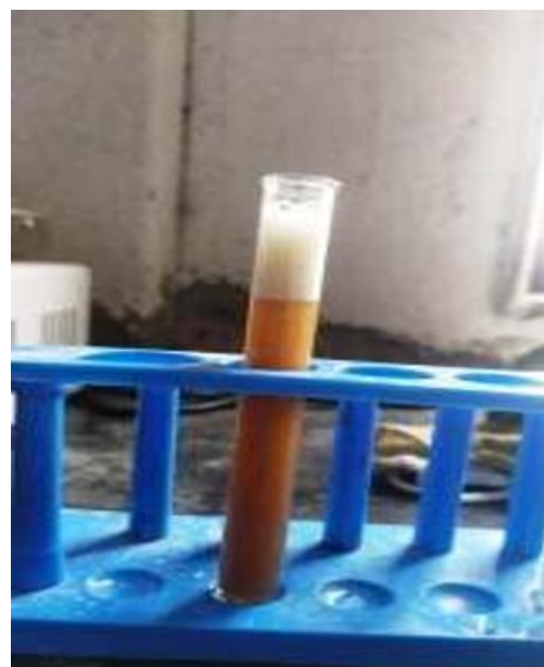
Figure 9: Foaming ability and foam stability