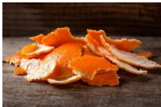
Figure 7: Orange peel