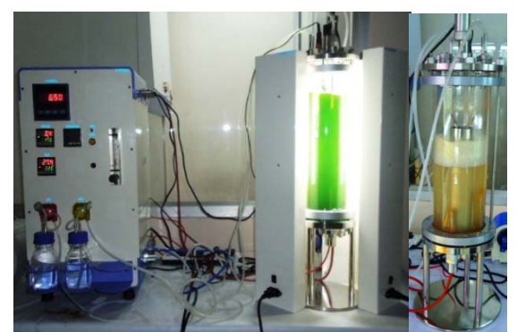
Figure 2: Haematococcus pluvialis cultivation and red stage (Aplanospore) in Photobioreactor

All the optimized parameters including pH-7.0, 12:12 hrs of photoperiod of light and dark, 0.3 M concentration NaNO<sub>3</sub>, 0.08 M concentration of K<sub>2</sub>HPO<sub>4</sub> and 0.08 M concentration of NaHCO3 were followed for cultivation of Haematococcus pluvialis in Photobioreactor. The three ingredients including NaNO3, K2HPO4 and NaHCO3 were given in the medium and other condition factors such as pH and light were set inside the medium and maintained using 1 N NaOH and 1 N HCl using inbuilt pH meter inside the Photobioreactor and external light was provide outside the photobioreactor set up of 15, 000 lux (Fig. 2). Green coloured vegetative stage was obtained after 26<sup>th</sup> days of incubation. Environmental stresses especially light (30, 000 lux) and specialized medium were used in case of astaxanthin induction in Airlift Photobioreactor cultivation of Haematococcus pluvialis. Red coloured stage was initially seen at 15<sup>th</sup> day of incubation and whole biomass was harvested on 20<sup>th</sup> day of incubation and approximately 3 g of dried biomass from 3 l airlift photobioreactor cultivation was harvested centrifugically.