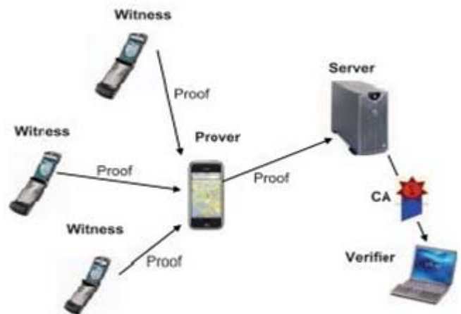
Figure 2: Location proof updating architecture and message flow

given time limit as shown in Fig. 2. In paper [2] the most important facet is users can dynamically change their location privacy preferences in real time and can also check whether and when to accept a query related to location proof.