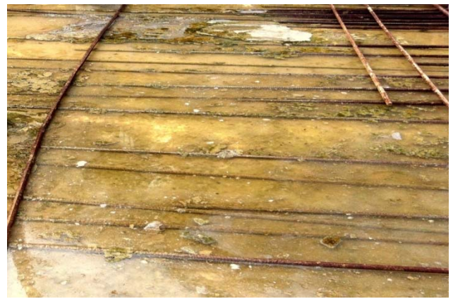
Figure 6: Rebars Placed Get Exposed to Water, Resulting in Rusting

All the above discussed complications take place due to uncontrolled underground water table. Investigation revealed improper or less efficient dewatering system which leads to such complications and if not controlled all these factors have potential to cause catastrophe and delay the project to a large extent. Fig. 7 demonstrates such problems.