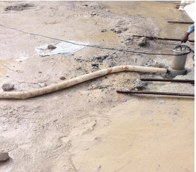
Figure 1: Deep Well Pump Dewatering System Used For Dewatering Excavated Area

Fig. 1 and Fig. 2 illustrates a deep well pump dewatering system used for dewatering of excavated area and Gravity method dewatering system: centrifugal pump used to prevent rise in water table for foundation construction of a multi-tower high rise building project near Pragati Maidan area in Delhi. The depth of excavation is 15.25 meters i.e. around 50 ft below N.G.L for the 49331.18 sq mt. excavated Investigation revealed insufficient dewatering area. procedures for excavated area as 32 deep wells with 15-cm dia. pumps were used to draw down water-table. However, out of these 32 more than 10-12 pumps were found always out of order and no proper monitoring of water table was done because of which huge amount of water was stagnated in excavated area which was resulted in deposition of slurry and muck and unworkable conditions for labour. Problem is shown in fig. 3.