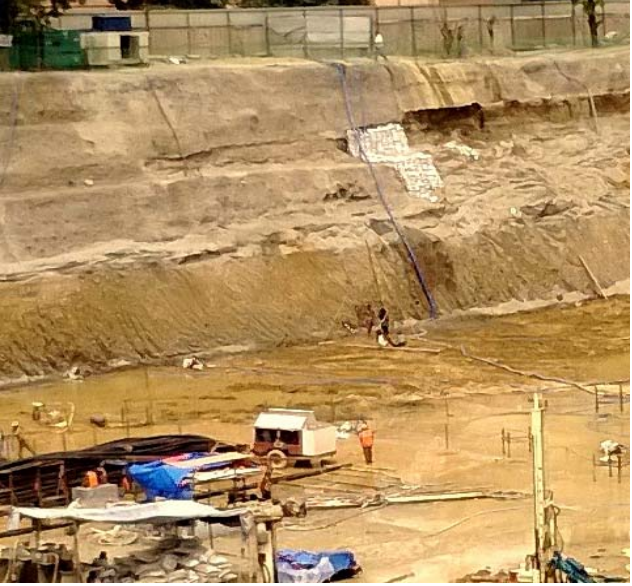
Figure 4: Stabilization of Slopes By Soil Nailing And Shotcreting.