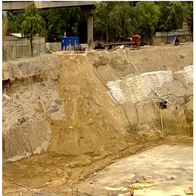
Figure 5: Soil Erosion From Earth Brim Due to Delay in Shotcrete.

It was reviewed that poor workmanship in reinforcement placement is common in raft (foundation), and columns. Generally as there is no proper spacing maintained between rebars. Problem is evident when the de-shuttering reveals the bars exposed, without concrete cover. Clearly, such structures are less capable of accommodating proper strength and are susceptible to premature deterioration. In many cases the rebars get exposed to water, resulting in rusting. Such a problem is shown in Fig. 6.