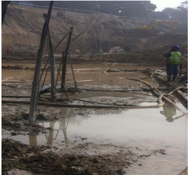
Figure 7: Deposition of Muck Due To Ruptured PCC

foundation, underpinning, or grouting of the existing foundation should first be performed.