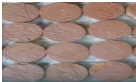
Figure 3 c): Concentration III