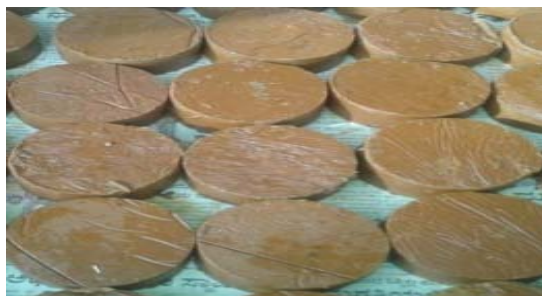
Figure 3 b): Concentration II