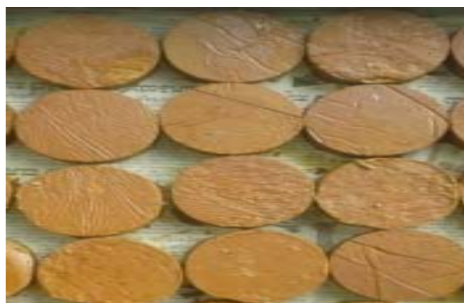
Figure 3 a): Concentration I