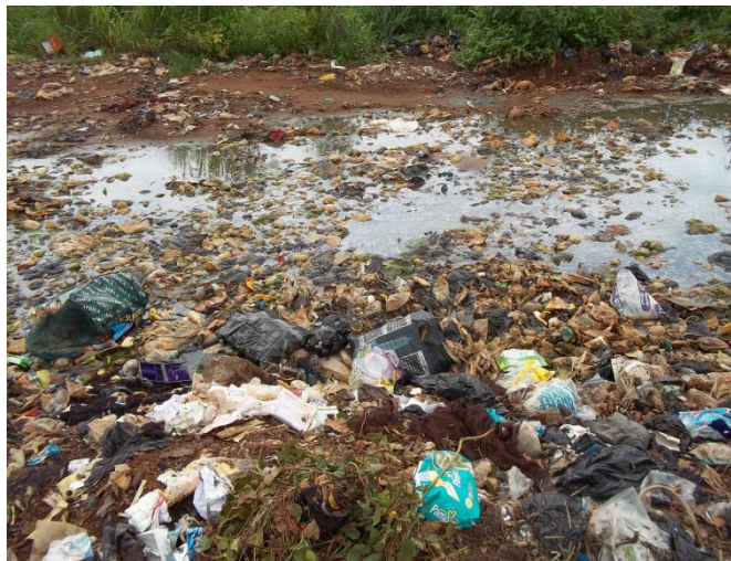
Figure 1: Typical solid waste polluted stream, Ohugbudu in Abakaliki, Ebonyi State, Nigeria.

Most water bodies in Nigeria especially local streams are largely polluted with solid wastes. A typical example of such scenario is shown on Figure 1. Ahianba et al reported that about 40.1% of Nigerians derive their sources of water from groundwater sources in which 28.27% use water from hand-dug wells and 11.83 % got their water from boreholes [15].