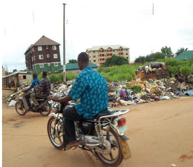
Figure 2: Open dumping site at Goddy Ogbaga Avenue, Abakaliki, Ebonyi State

caused by; illiteracy, poverty, lack of awareness, poor sanitation policies, inadequate attention by sanitation authorities, unchecked urbanization, lack of the proper technology and skills to address such issues amongst others. In every States in Nigeria, it is very common to find solid waste littered indiscriminately on the streets or heaped at strategic corners. Figure 2 gives a picture of an open dumping site in one of the most popular street in Abakaliki metropolis, Ebonyi State, Nigeria. The volume of waste generated from households, industries, and commercial establishments in Nigeria are increasing at an alarming rate and these wastes are not being collected and disposed in a sustainable manner. This has been reported in the literature [11], [23] – [26]. The nonchalant attitude of the staff of environmental protection agencies in Nigeria on waste collection is not helping matters either. A typical abandoned industrial waste from Abakaliki Rice Mill Industry is shown on Figure 3. These abandoned wastes pollute the land that could have been used for agriculture, residence, or for other good purpose. They also pollute the air within that neighborhood and as well constitute serious nausea, eyesores and serves as a potential breeding ground for germs and bacteria. Also most abattoirs in developing nations use waste tyres for open roasting method and this generate serious greenhouse gases into the atmosphere. A typical example is shown on Figure 4.