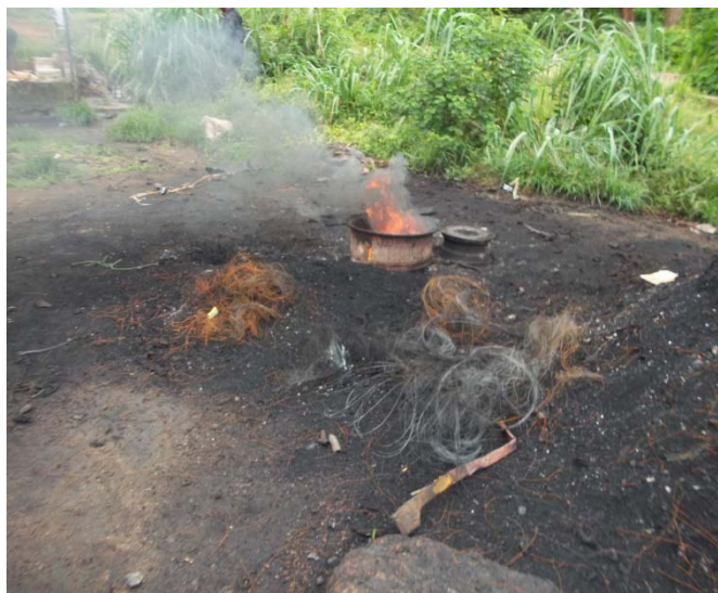
Figure 4: Typical roasting ground at Kpiri-Kpiri market, Ebonyi State, Nigeria.

This research work was carried out using a literature based conceptual approach; hence the author reviewed literature on waste resources in Nigeria. The work then discussed the impact of waste resources on the environment, and consequently on climate change. The study further discussed on the implications and mitigation with particular reference to Nigeria.