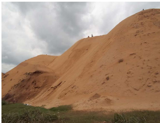
Figure 3: Rice husk hill in Abakaliki Rice Mill Industry, Ebonyi State, Nigeria.