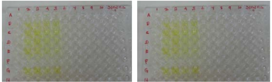
Figure 2: DAC-ELISA Microplate showing positive reaction in 4 samples (yellow colour) & known positive control