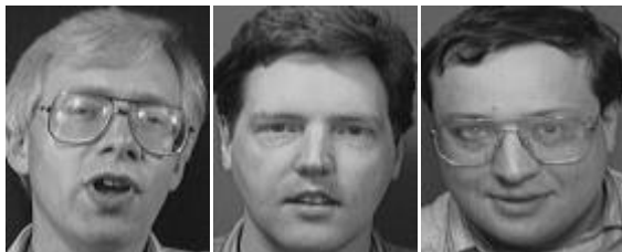
Figure 1: Testing Images from the proposed face recognition model

The following systems were implemented using MATLAB 2012a and tested on an Intel Core i3 with 4GB of RAM running Windows 7. This platform should be considered as the minimum hardware requirement since the face detection and recognition algorithms could have been modified for increased accuracy on a more powerful testing platform. Automated face recognition has become the holy grail of computer vision artificial intelligence. It is probably the most challenging and ambitious of the computer vision projects that are being studied and is not just a fascinating theoretical problem, but there is a real-world need for such a system. This section of thesis represents some computational results of our proposed program. In Experimental result-image 1 and Experimental result- image 2, both test image and equivalent image which is stored in database have same pose. But test image and equivalent image have different in pose which are shown in Experimental result-image 3 and Experimental result- image 4.