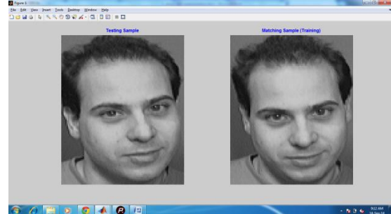
Figure 3: Results obtained from the proposed model.

Here correlation with the average face is used to verify the potential face locations proposed by the fully automated face detection system. Condition A and B images are as with the previous test. Condition of images Total tested Successful detection Failures