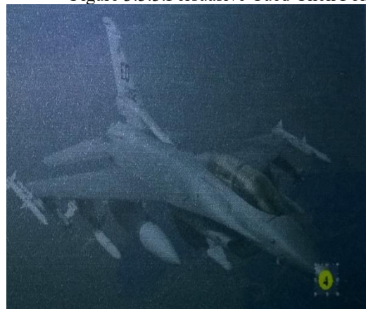
Figure 3.3.4.Persuasive Cued Click Point