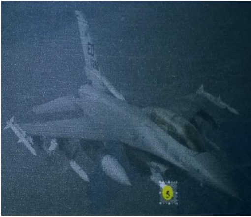
Figure 3.3.5. Persuasive Cued Click Point