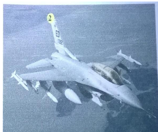
Figure 3.2.1: Cued Click Point

In Cued Click Points [1], [4], [5] method, user selects one point per image for minimum five images. At a time only one image is displayed. When user select click point it goes to next image.