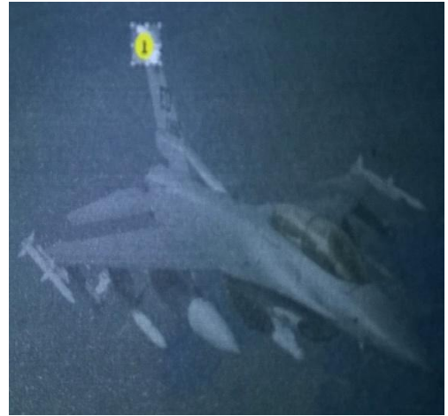
Figure 3.3.1.Persuasive Cued Click Point

In Persuasive Cued Click Points method [1],[2],[3],[4], [5] we provide small vies port area that is position on image, therefore user must select click point the view port. If user is unable to select click point within a view port then user press shuffle button.