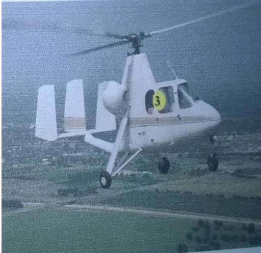
Figure 3.2.2: Cued Click Point