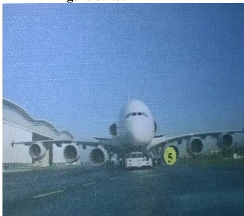
Figure 3.2.4: Cued Click Point