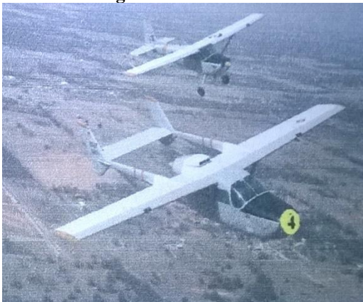
Figure 3.2.3: Cued Click Point