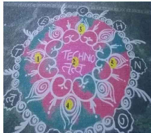
Figure 3.1: Pass Point

In Pass Points [1], [3], [5] is method where password consists of an ordered sequence of five click-points. User must click within some system-defined region on image.