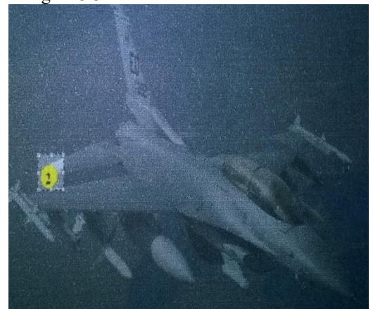
Figure 3.3.2.Persuasive Cued Click Point