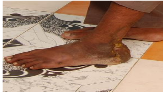
Figure 2B: Postoperative picture on day -15