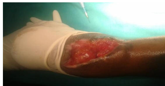
Figure 1A: Preoperative wound of infected tendoachilles repair