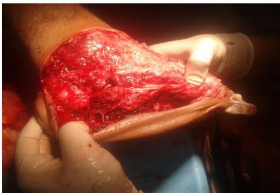
Figure 2A: Pre operative photo of sole degloving