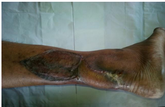
Figure 1D: Post operative picture on day-15