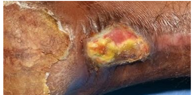
Figure 3A: Preoperative infected tendo Achilles wound