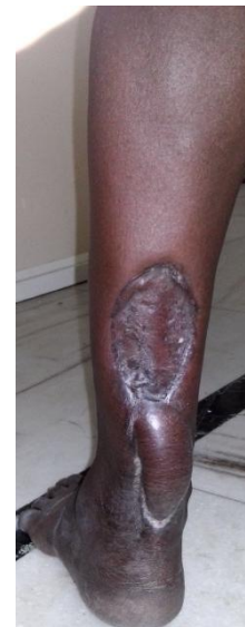
Figure 3B: Postoperative picture 45 th day