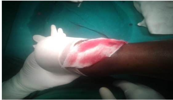
Figure 1B: Templating of the wound using sterile drape