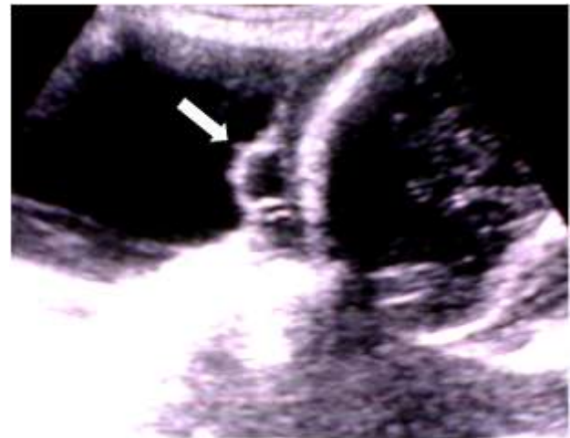
Picture 1: Longitudinal sonogram of LUS showing abnormal ballooning (arrow)

considered abnormal, and grade I and II were considered normal intraoperatively. The receiver operating characteristic curve was used to define the sensitivity and specificity for each measurement value of LUS and to determine critical thickness at which safe vaginal delivery is predictable.