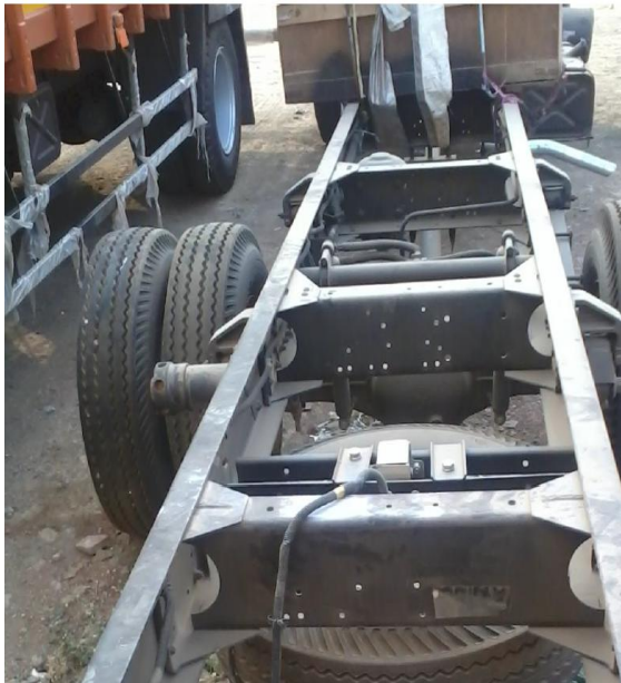
Figure 1: Construction of the common chassis frames

Generally for trucks commercial vehicle channel section is preferred over hollow tube due to high torsional stiffness. The chassis frame, however, is not designed for complete rigidity, but for the combination of both strength and flexibility to some degree. The chassis frame supports the various components and the body, and keeps them in correct positions. The frame must be light, but sufficiently strong to withstand the weight and rated load of the vehicle without having appreciable distortion. It must also be rigid enough to safeguard the components against the action of different forces. The chassis design includes the selection of suitable shapes and cross-section of chassis-members. Moreover, the design should consider the reinforcement of the chassis side- and cross member joints, and the various methods of fastening them together [3].