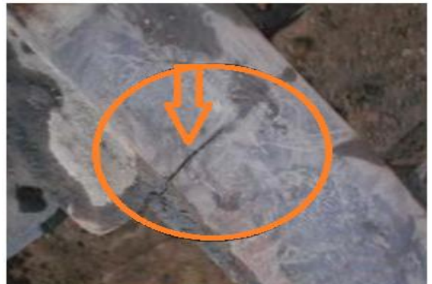
Figure 2: Fatigue crack of the sub-frame